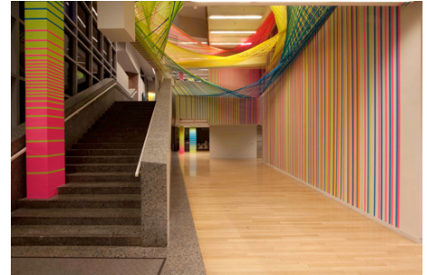
Megan Geckler Spread the ashes of the colors , 2010 Site-specific installation for the Wexner Center Flagging tape and additional mixed media Courtesy of the artist