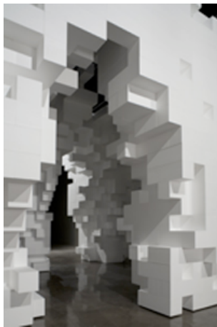
Tobias Putrih/MOS Erosion , 2009 Styrofoam, installed at MIT List Visual Arts Center, Cambridge, MA 261 1/8 x 261 1/8 x 179 7/8 inches Courtesy of the artists and Max Protetch Gallery, New York Photo: Michael Vahrenwald © the artists