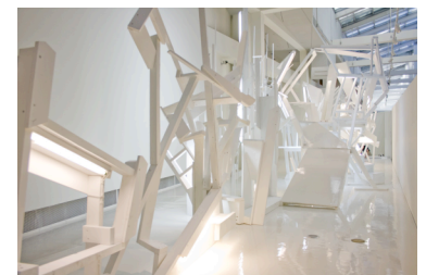
Gustavo Godoy Fast-formal Object: Flayed White , 2010 Plywood, metal, paint, and mixed media Courtesy of the artist and Honor Fraser Gallery, Los Angeles Installation view at the Wexner Center for the Arts; created for Six Solos, fall 2010

Los Angeles-based, Mexican-American artist Gustavo Godoy is known for creating unconventional gallery experiences featuring room-sized mixed-media installations. The site-responsive installation for the Wexner Center galleries engulfs the entirety of a trapezoidal space with a dramatic plywood construction that visitors can move through and around. The work is illuminated from within by fluorescent bulbs, an effect that is amplified by a glossy white vinyl floor treatment. This work, called Fast-formal Object: Flayed White , is part of Godoy's ongoing Fast-formal series that is as much concerned with aesthetics as with possible functionality. Visitors are invited to climb on the sculpture, one person at a time, at their own risk. Godoy's work has been included in exhibitions in