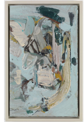
Katy Moran house , 2009 Acrylic on canvas 19 5/8 x 12 3/4 inches

Featuring more than 30 works created between 2006 and 2010, this exhibition is British painter Katy Moran's first solo museum presentation in the United States and provides a comprehensive survey of her development to date. Moran's intimately scaled, deeply felt paintings exist along the fault lines of representation and abstraction. Her earlier paintings often transcribe a single found image into paint using the loose, brushy style that has become her signature. Paintings from 2008 onwards, by contrast, tend to be works of imagination or memory, sometimes incorporating collage elements that add a new depth to her sensual, dynamic paintings. This exhibition and accompanying publication, featuring an essay by the curator, will look at Moran's compelling trajectory during the four-year period under consideration, contextualizing her paintings relative to important peers worldwide and drawing attention to her most salient predecessors, specifically the English painter Francis Bacon, with whom she shares many important affinities. Moran's work has been shown in New York, Italy, and the UK (including at the Tate Britain). She currently lives and works in London. To read more on Moran, go to: http://www.andrearosengallery.com/artists/katy-moran/ , http://www.anthonymeierfinearts.com/artist/moran/artistmain.htm and http://www.modernart.net/artists/katy-moran