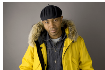
Top: Cape Farewell project, under the direction of David Buckland.