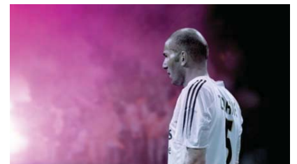
Douglas Gordon & Philippe Parreno Zidane: A 21st Century Portrait, 2006 Two video projections