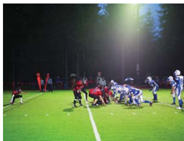
Catherine Opie Football Landscape #5 (Juneau vs. Douglas, Juneau, Alaska) , 2007 Chromogenic print 48 x 64 in.

Columbus, OH—The multimedia exhibition Hard Targets , on view January 30–April 11, 2010 at the Wexner Center, surveys provocative artworks produced over the last 25 years that take masculinity and sports as their central themes. Ranging broadly in interest and focus from biology to commodity and locker room to stadium, Hard Targets endeavors to complicate and revise the time-honored archetype of the male athlete as an aggressive, heterosexual, hyper-competitive, emotionally remote subject. Instead, the artists in the show offer