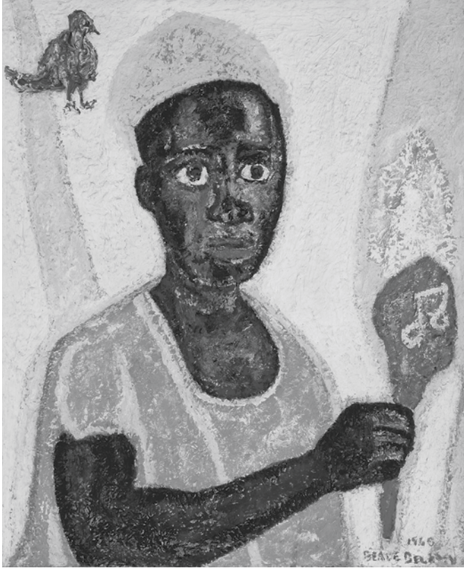
Beauford Delaney, Portrait of Charlie Parker, 1968. Oil on canvas, 28 1/4 x 23 1/2 in.