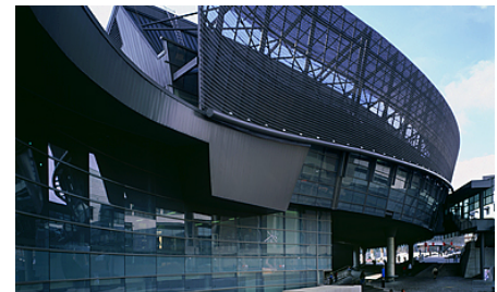
University of Cincinnati Campus Recreation Center

Mayne's notable projects have included the University of Cincinnati's Campus Recreation Center (2006); the Federal Office Building in San Francisco (2006); the Los Angeles Caltrans District 7 Headquarters (2004); Diamond Ranch High School (1999) in Pomona, California; Silent Collisions (1999), a major installation at the Netherlands Architecture Institute in Rotterdam; Sun Tower (1997), a retail and office building in Seoul, Korea; and a moveable set for the Charleroi/Danses Plan K Dance Group in Brussels, Belgium (2003). In New York City, Morphosis's designs won highly coveted architecture